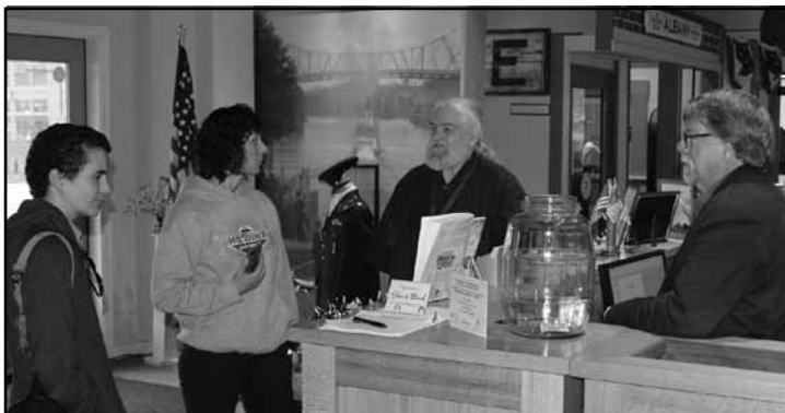
Future Museum volunteer at Veterans Day festivities.