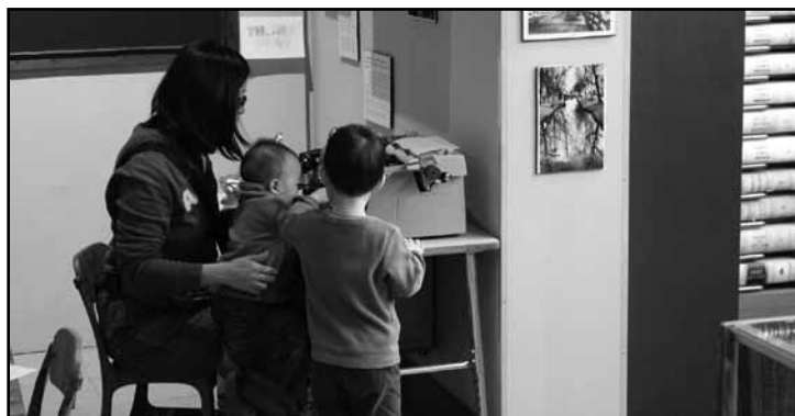
Mom and her boys enjoying the children's area on Veterans Day.