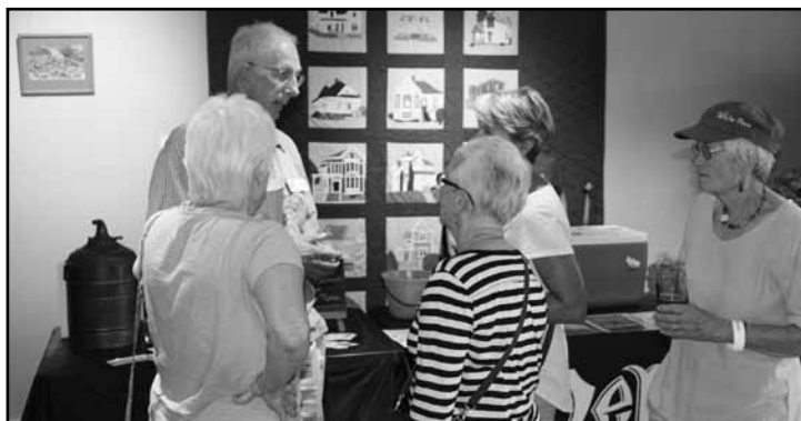
David's Harem at Craft Brew Smackdown.