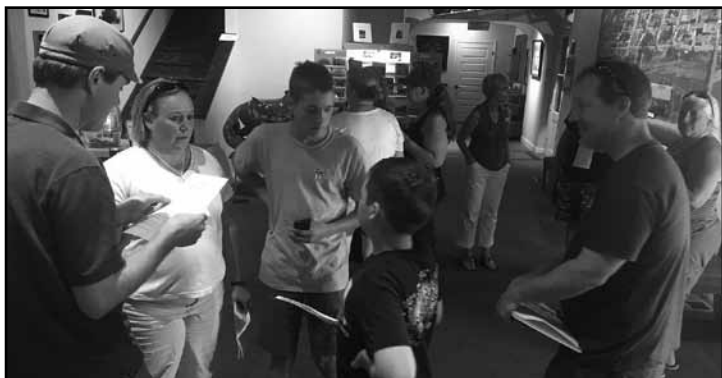
What is the puzzle? Geocaching with NW Art & Air.