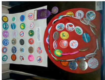
exhibit will be expanding over time as we collect more memorabilia and artifacts from donors who will no longer be wearing the "Red Hats," plaid shirts, jeans, and the yearly buttons!

volunteers to keep it running. We are very disappointed this great logging event will no longer be a part of our Albany summers. It will have a marked effect on tourists and visitors to our community, which we will miss very much. We invite you to visit our museum and look over our ongoing Timber Carnival exhibit. This