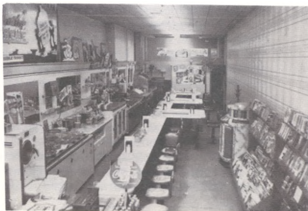
Fountains and magazine racks were a good way to keep those customers from bothering you on the sales floor.

During the time from its founding in downtown Albany until its move to the Waverly Drive location, Payless Drug store was one of the busiest merchants in town and was a major player in downtown history.