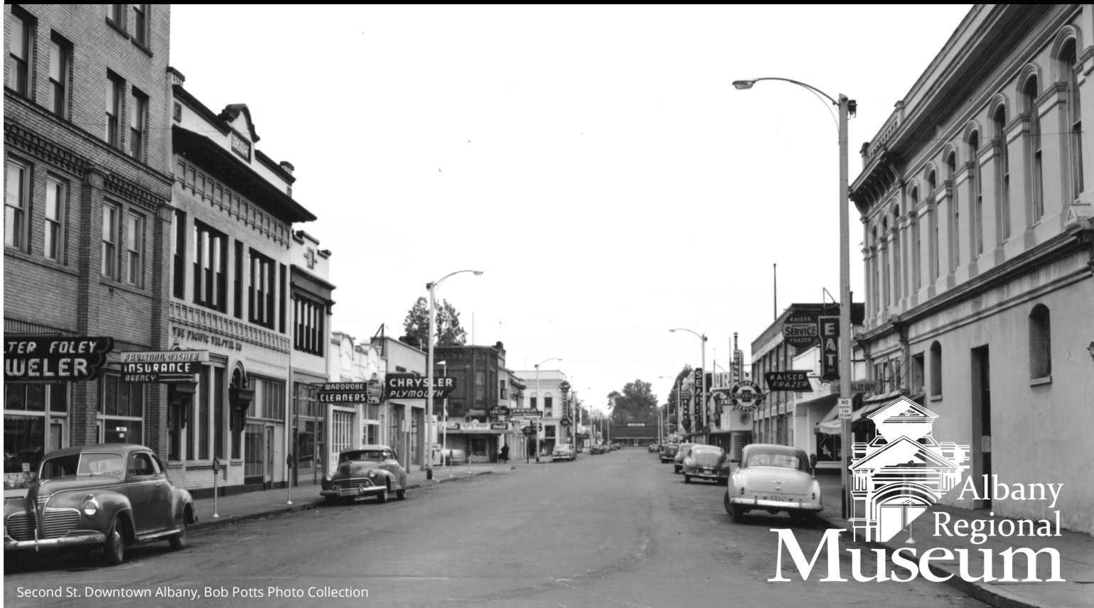
Second St. Downtown Albany