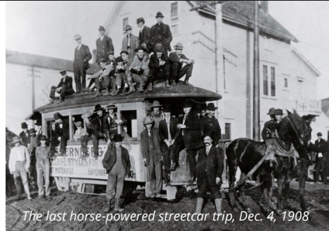
The last horse-powered streetcar trip, Dec. 4, 1908

When railroad service arrived in 1870 in Albany, Albany hotels would send carriages to meet passengers, but carriages were a liability, unclean, and a rough ride, especially during the rainy season.