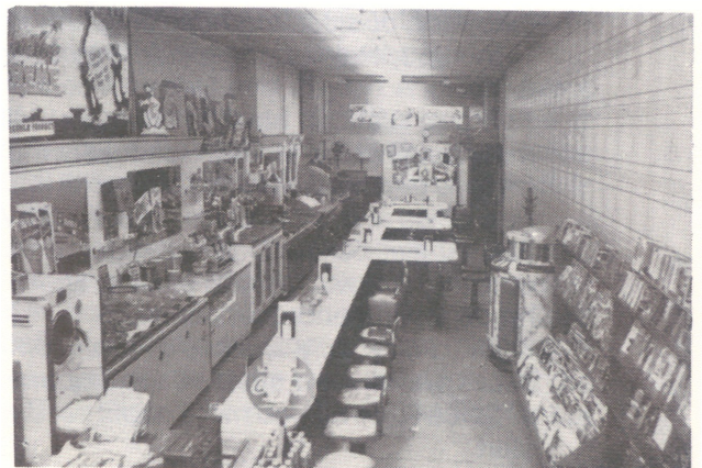
Fountains and magazine racks were a good way to keep those customers from bothering you on the sales floor.

During the time from its founding in downtown Albany until its move to the Waverly Drive location, Payless Drug store was one of the busiest merchants in town and was a